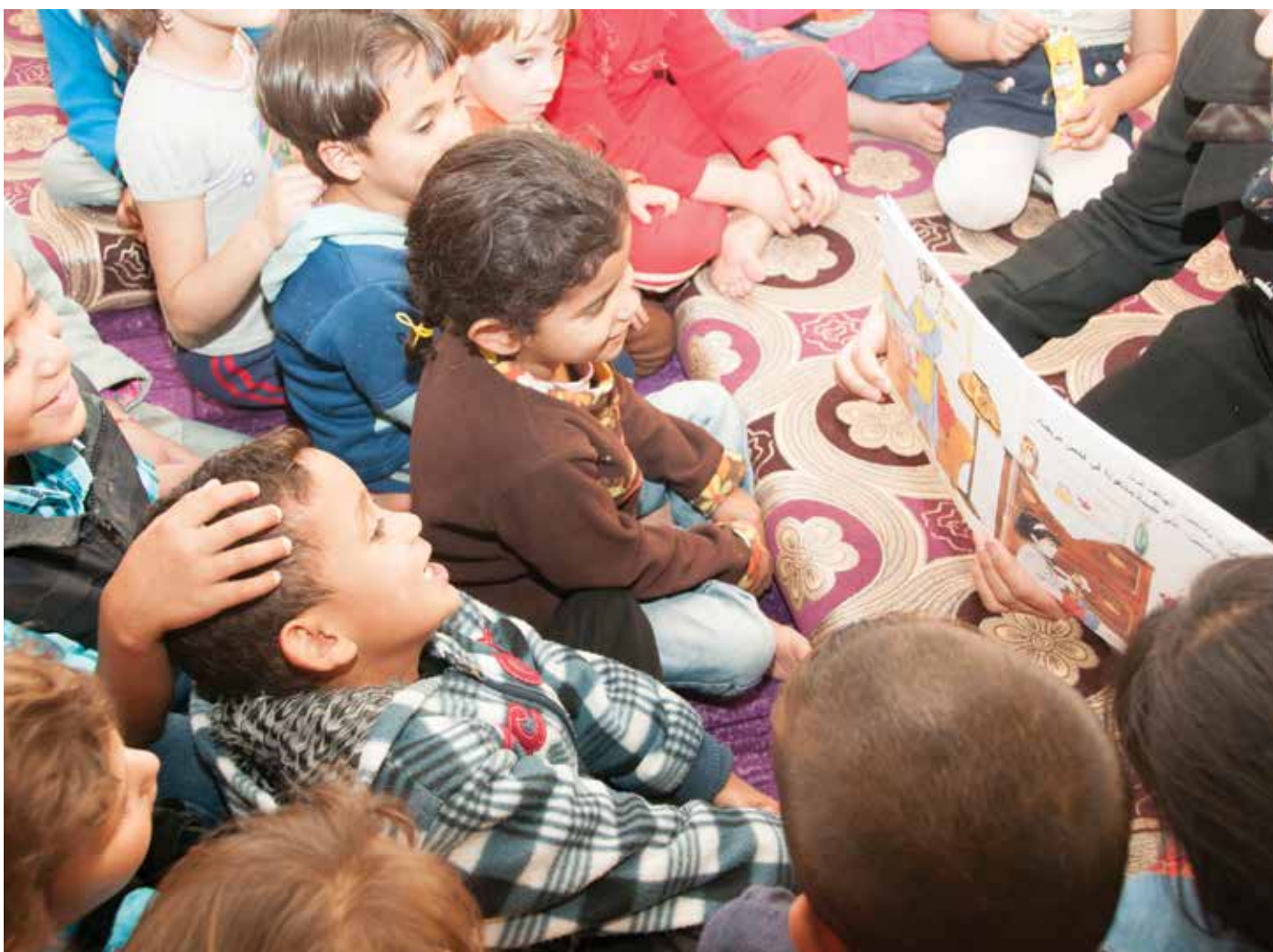
Photo: In Jordan, 95% of volunteers found the program had cultivated a love reading among children.

One of the major challenges in We Love Reading's growth is maintaining the quality of the program as it scales outside Jordan and Ethiopia. To address this challenge, We Love Reading has developed a coach training to maintain quality of trainers, and an online training course for We Love Reading ambassadors.