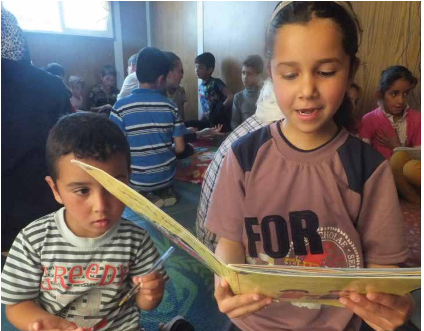
Photo: Children enjoying a reading aloud session in Jordan.

“We started reading under trees, children saw the books and started coming. We need to read in our own language, We Love Reading helps our children.”