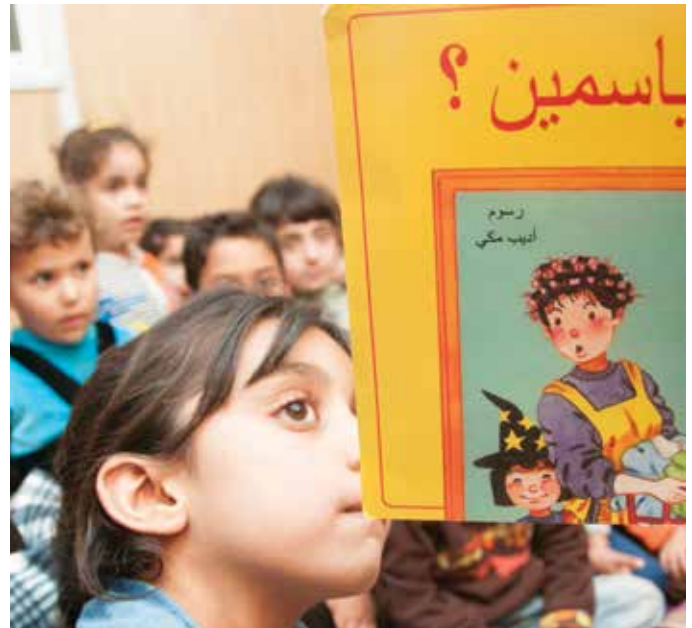
Photo: In Jordan, 75% of volunteers witnessed a positive change in children’s behaviour after attending the reading aloud sessions.